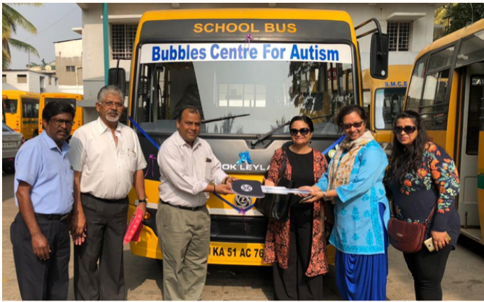
School bus donated by Hans Foundation for the students and staff to commute